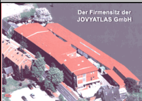
Der Firmensitz der JOVYATLAS GmbH

JOVYATLAS GmbH Company I Groninger Straße 29-37 26789 Leer phone: +49 (0)491/6002-0